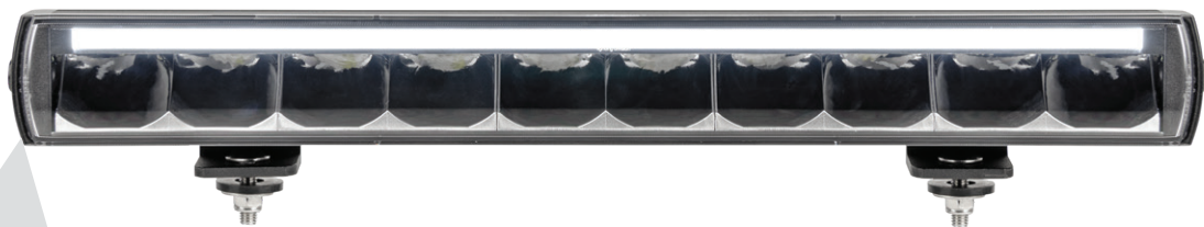
Shown with daytime running light on