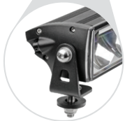
Supplied with both rear and side mounting brackets